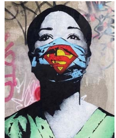
Street Art by FAKE; Amsterdam, Netherlands. Nurse with a mask with a Superman logo.

It is highly likely that the virus originated in its natural host, the horseshoe bat ( Rhinolophus affinis ) and spilled out via some wild animals such as pangolins, and from a seafood and meat market into humans. The human to human transmission of the virus is via direct transmission (cough, sneeze, droplet dispersal and droplet inhalation) and contact transmission via oral, nasal and eye mucous